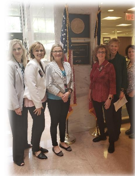
BPT advocates visited Senator Grassley's office.

The Beyond Pink TEAM advocates work tirelessly to make sure women and men have access to the quality care they need and deserve during their breast cancer treatments. They contact our legislators regularly so they retain the Breast and Cervical Cancer Treatment Act, which Senator Chuck Grassley led through the Finance Committee. It was signed into law in 2000. Beyond Pink TEAM advocates began Ignite the Cancer Conversation in 2016 in order to educate and involve our community in efforts to end breast (and all) cancers.