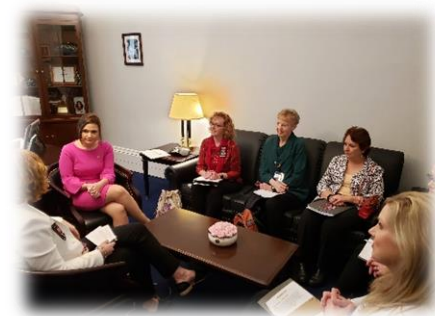
BPT members visit with Abby Finkenauer.

The final day of the Summit is "Lobby Day". This is an opportunity for attendees (advocates) to visit offices of our four Representatives and both Senators asking them to support quality health care for all and innovative research through the Department of Defense Breast Cancer Research Program.