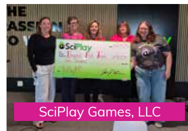
SciPlay Games, LLC