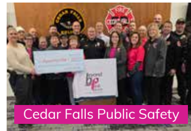
Cedar Falls Public Safety