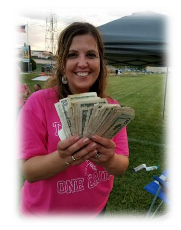
Columbus Softball Team makes donation to the Beyond Pink TEAM

I know if you're going through cancer now or if you recently have, it feels like you'll never get better. My advice is to take one day at a time and to find at least one thing each day to feel grateful for even when life seems so hard. Attitude can make such a difference in your body's ability to heal. Find something to do that can help you clear your mind when feeling anxious, whether it be prayer, reading, coloring, music, talking, yoga, a quick walk or perhaps a hobby. Please know that you are loved and that there is help out there if you need it. Don't be afraid to ask! There are resources available and you most likely have a family member, friend, a church or community member that would love to feel needed! A lot of people want to help but just don't know how. Think of the people that have told you to let them know if you need something. Take care of yourself!